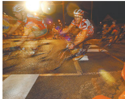
The riders in this men's criterium moved so fast they appeared to be a blur as they pedaled through the streets of downtown Anniston.